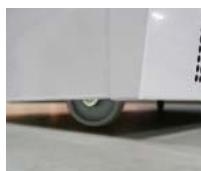
Castor wheels as standard (Deli Roses)