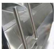
Holders for flower accessories as an option