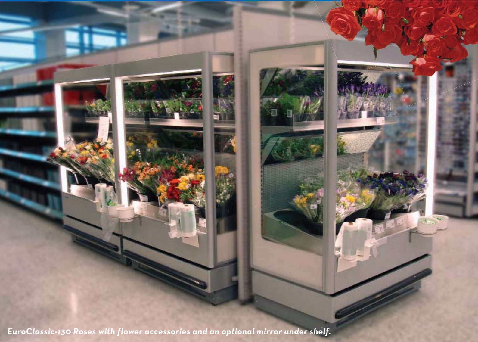
EuroClassic-130 Roses with flower accessories and an optional mirror under shelf.