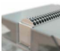
Back-to-back mounting kit for Deli as an option